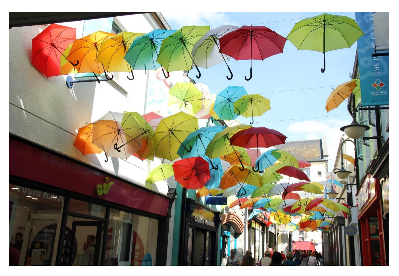
EIR Shop, Market Centre, Kilkenny