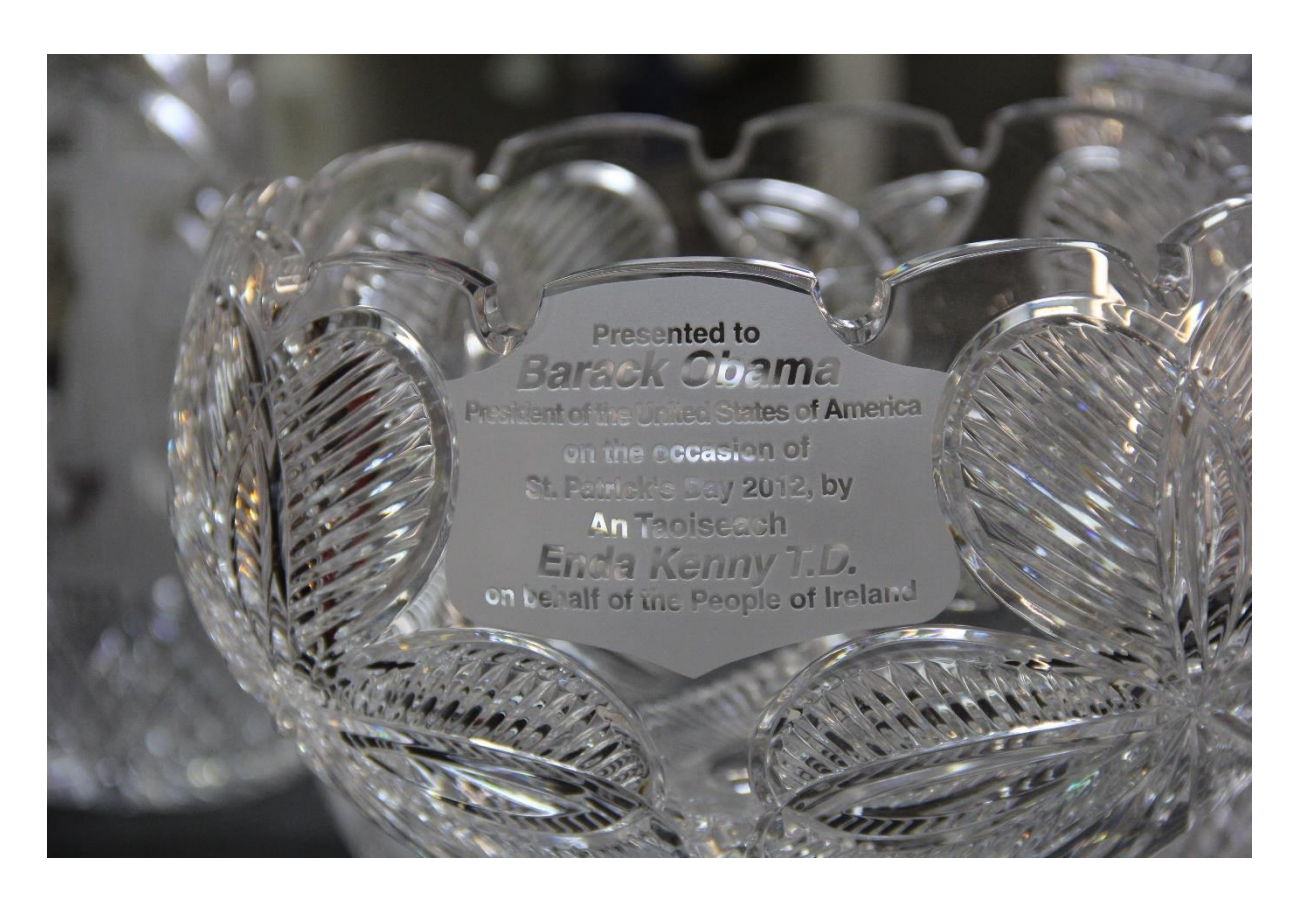
Replica of the Crystal bowel used for the presentation of shamrock on St Patrick's Day 2012