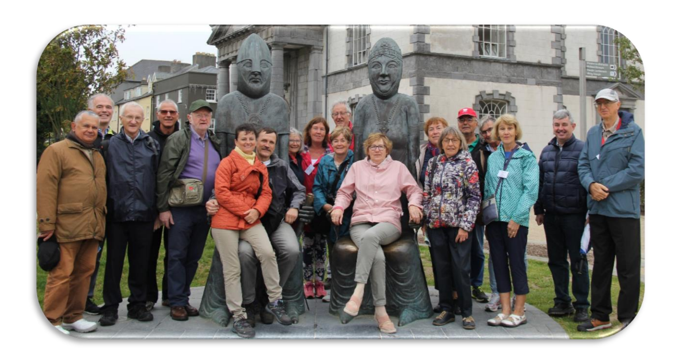
Visit to bronze sculpture of Strongbow and Aoife in the heart of the Viking Triangle, Waterford.