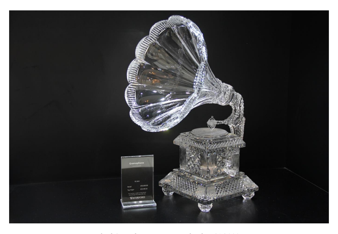
Waterford Crystal Master Piece, valued at \ensuremath{\epsilon} 15,\!000 euro.